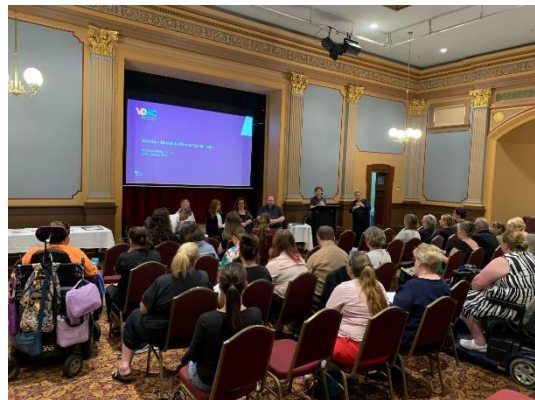
Image 2: This image shows the Commission presenting to the audience at its public forum held at the Bendigo Bank Theatre.