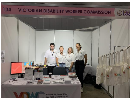
Image 1: This image shows VDWC staff standing at the Commission's booth at the Melbourne Disability Expo.

The Commissioner also participated in DARU's recent Strengthening Disability Conference and featured in a video on 'What advice would you give to new advocates?' .